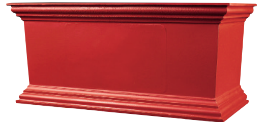
Ornate Plain RWH209

PLEASE SEE HOPPER POSSIBLE OUTLETS SHEET FOR ALL COMBINATIONS AVAILABLE.