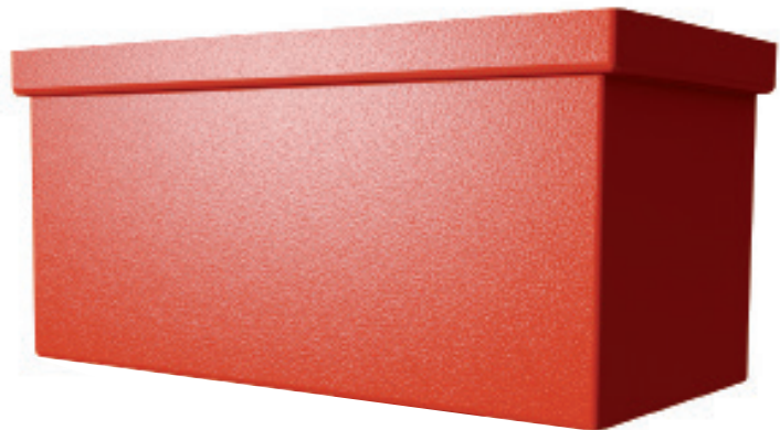
Extra Large Rectangular RWH660