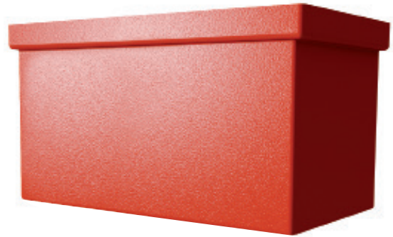
Large Rectangular RWH640