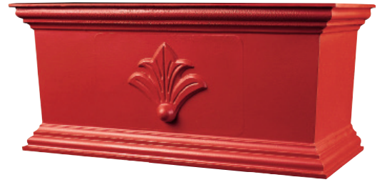
Ornate With Motif RWH209-1

FOR CUSTOM MOTIFS, NUMERALS OR NAME PLATES ETC. PLEASE ASK.